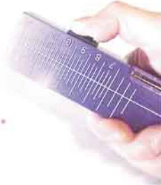
Replace the cover and test the laser