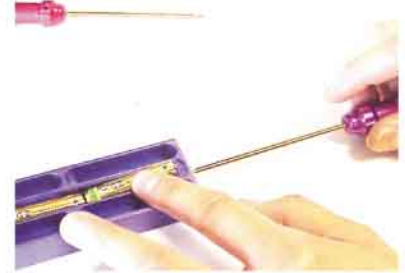
You may need to adjust the contact nut