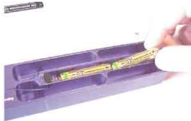
Install 2pcs AAA batteries