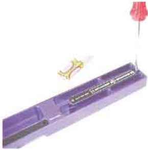
Open battery back cover

WARNING! NEVER LOOK DIRECTLY AT THE LASER POINTER OUTPUT DO NOT DIRECT THE LASER POINTER AT ANOTHER PERSON'S EYE