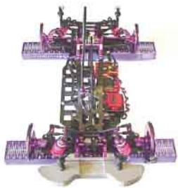
Center your car on the unit